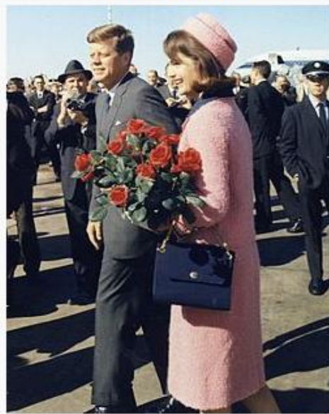
Pink Chanel suit of Jacqueline Bouvier Kennedy